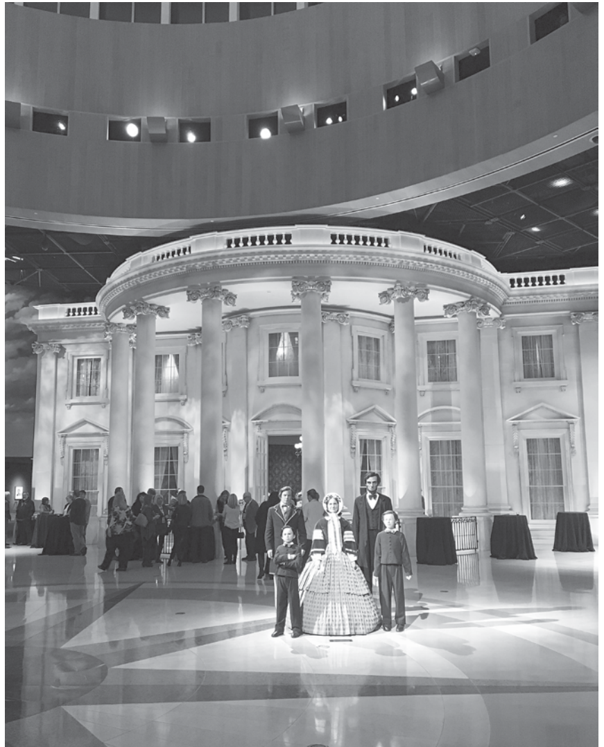
SUNDAY NIGHT PROGRAM of the 110th Annual Educational Conference in 2017, at the Abraham Lincoln Presidential Museum.

As remarkable as he was, it took more than 125 years for Lincoln to get his own presidential library and museum. I have visited the museum on several occasions and TOI has held events there as part of our Annual Educational Conference